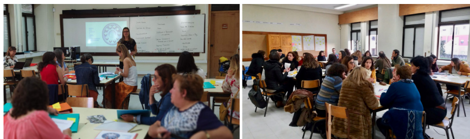
Figure 10 – 11: Images from the school-wide continuous teacher training programme.