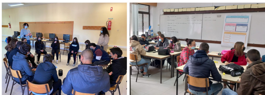
Figure 14 – 15: OSHub facilitate sessions held in schools.