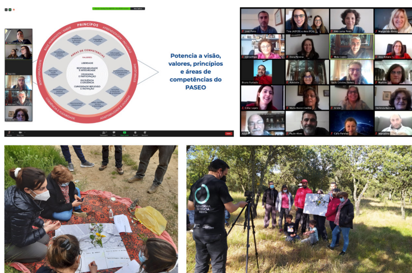
Figure 6 – 9: Photos from teacher training sessions, both online and in-person.