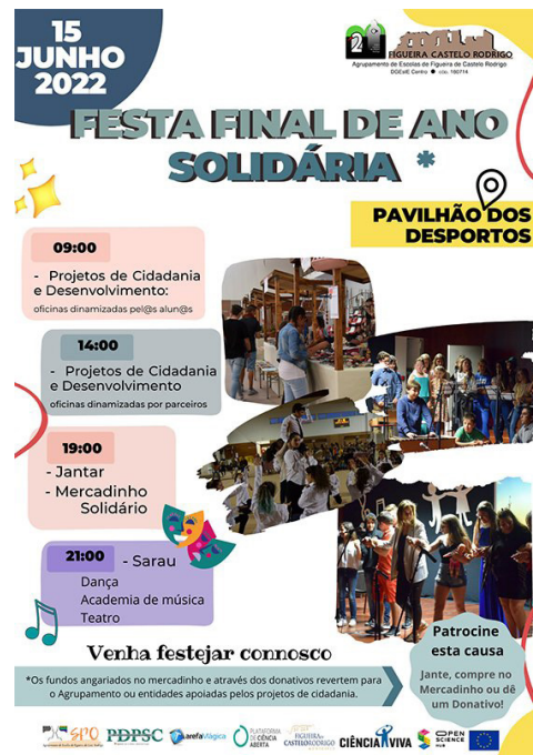
Figure 16: Poster for the end-of year showcase featuring OSHub activities.