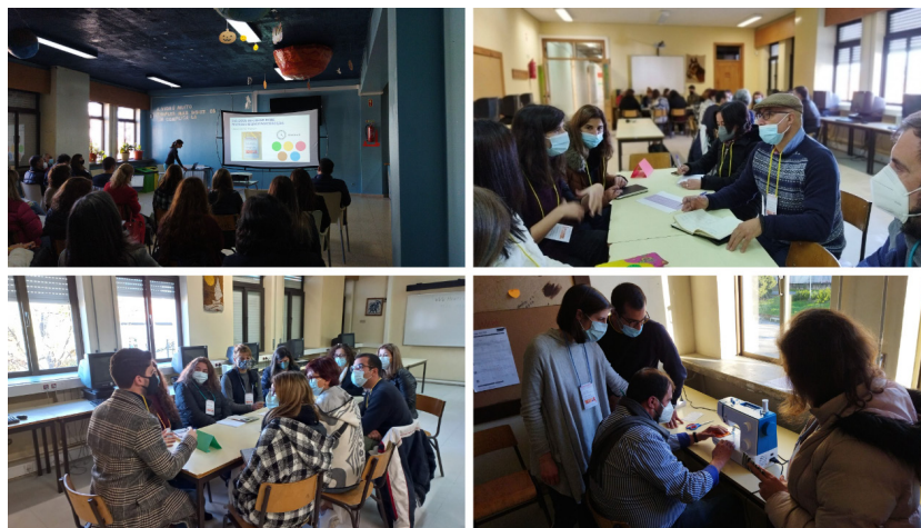
Figure 17: Images from the open-schooling forum.