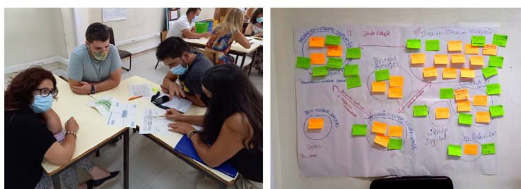
Figure 12 – 13: OSHub-PT follow up sessions with teachers.