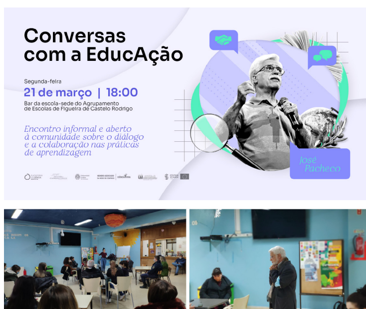
Figure 22 – 24: Poster and images from the first 'Conversas com a Educação' event.