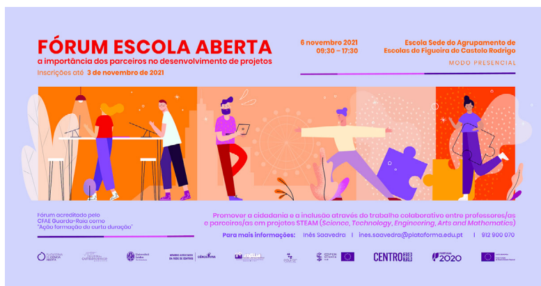
Figure 18: Poster for the open-schooling forum (brokerage event).